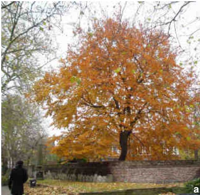
a Beech tree in autumn colour in the corner of the vicarage garden, behind the monument and headstones against the wall. A Tree Preservation Order (TPO) has been applied for for this fine tree.