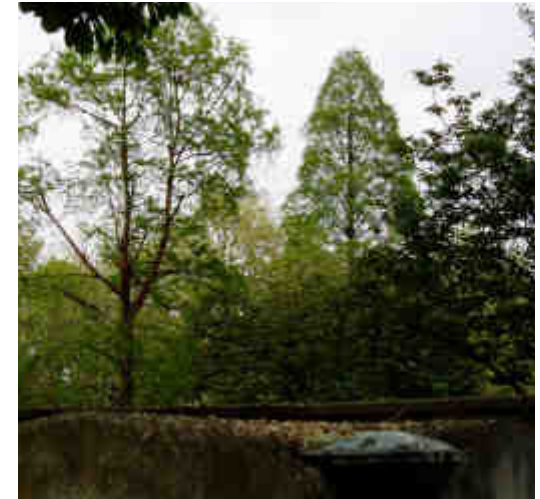
Dawn redwood (centre) in the walled garden was only known from fossils, until it was discovered growing in China in 1941. To its left is a swamp cypress.