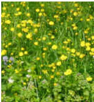
Below: Buttercups add spring colour to the grassland. Right: Summer-flowering crocuses grow in the dappled shade beneath a tall lime tree near the Mare Street end of the churchyard.