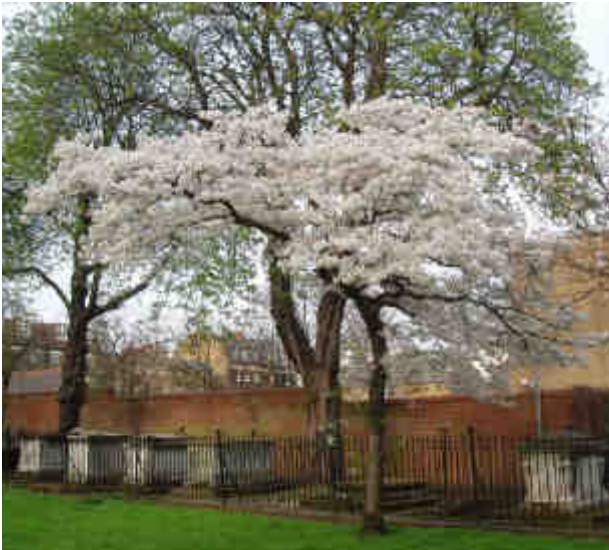
Japanese flowering cherry tree by tombs in the railed enclosure.

St. John-at-Hackney churchyard connects Mare Street with Lower Clapton Road to the north, and Sutton House and Sutton Place (1810 terrace) to the east; it is an important pedestrian thoroughfare. The old churchyard, which was declared full in 1859, was converted into open space in 1893 and the graves were grassed over. The headstones were moved to the perimeter walls and chest tombs were moved to a railed enclosure. The churchyard re-opened as St. John's Gardens in 1894, and its care and maintenance were transferred to the local council.