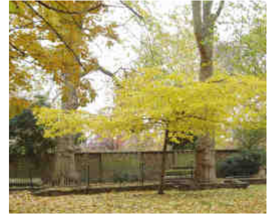
Above: Maple in autumn colour. Openings have now been created in the walls behind to improve visibility.

collection of trees in Britain. Loddiges were the main supplier to Abney Park arboretum.