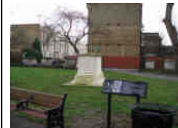
Above: The tomb of the Loddiges family. The flowering cherry trees were a fine addition to the memorial of Hackney's most famous plantsman. The tomb now stands in sterile splendour (left).