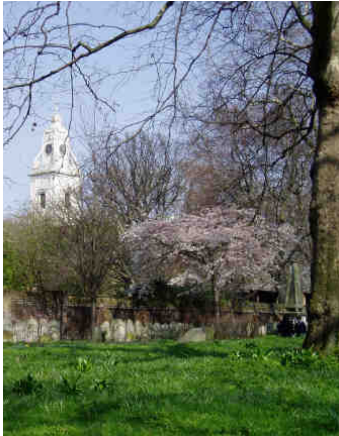
View of the church from the south. The path by the perimeter wall links Mare Street to Sutton House and Urswick Road. The headstones against the wall are from the old churchyard, which was declared full in 1859, grassed over, and converted into open space in 1893.