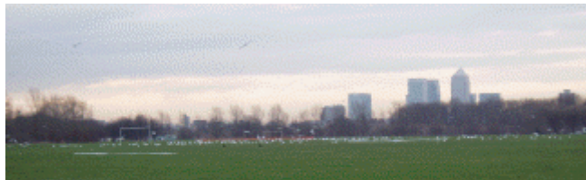
Docklands skyline, looking south-west from Hackney Main Marsh